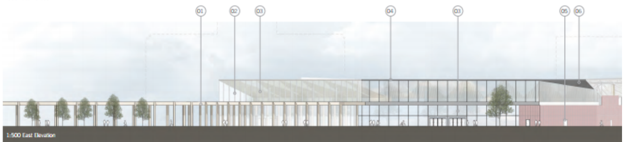
1:500 East Elevation